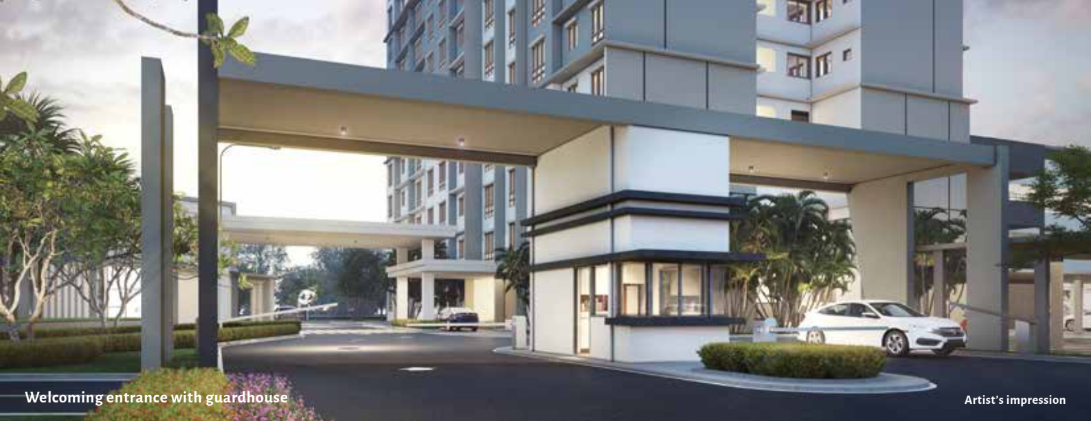
Welcoming entrance with guardhouse